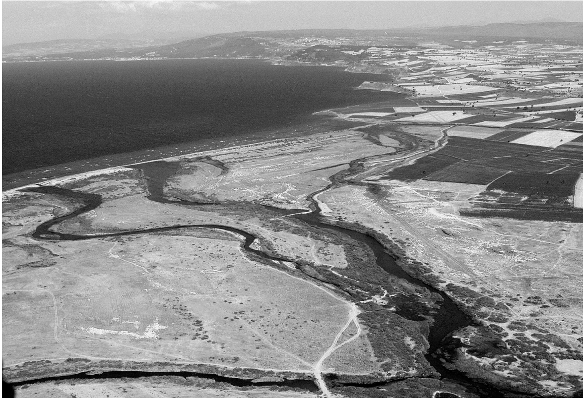
Fig. 4: The Scamander plain and the delta (Höhfeld 2009, 112).

»good Greek« and interprets it to be »the one with the seven paths/arms« 93 [FK]. Johannes Tischler renders the name more precisely as »river with seven fords« 94 [FK], which is also the interpretation in Demetrius of Skepsis in Strabo 13,1,10/C 587: »Now near Zeleia is the Tarsius River, which is crossed [διαβάσεις] twenty times by the same road, like the Heptaporus, which is mentioned by the poet, which is crossed seven times« [translated by Horace Leonard Jones]. Of course, according to ancient thought, the number »seven« is interpreted symbolically, just as the number 40 in modern names of two northern Greek rivers »Sarandaporos«, which means »river with forty« of simply »many crossings«. 95 Homer could have created the name of the river Heptaporus as a second name to facilitate the verse and transformed it from another name for this river. In any case, however, all four river names in M 20 contained the onomatopoeic »rho«, and, in the intervocalic position in »Heptaporus«, it stands out. Objectively, this name for the envisioned river near