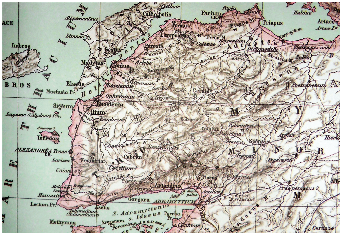
Fig. 1: Detail from Map »Asia provincia« of the Formae orbis antiqui (Kiepert 1894, map 5).

extant only in small traces or even hidden in the ground or tacitly presupposed everywhere in his battle descriptions as already known. 21 And so today, those who know the Troad no longer doubt that the clarity of the perception about the area of the epic events and their pervasive hidden coherence presumed intimate knowledge by the poet and the very astute knowledge of his first northern Ionian listeners. 22 The question of where that kind of exact knowledge of a landscape originated, a landscape remote from their own homeland, can be answered only hypothetically. Alongside the poet's historical interest in a verification of the sites of the Troy myth, 23 activities by the poet's northern Ionian audience involving alliance policies 24 and economics 25 may also have played a role. Evidence of these possible activities is the noticeable integration into the epic of the eastern Troad around the later northern Ionian core settlement between Lampsakos (Lapseki today) and Parium and its hinterland, 26 an area rich in mineral and other natural resources, evidence