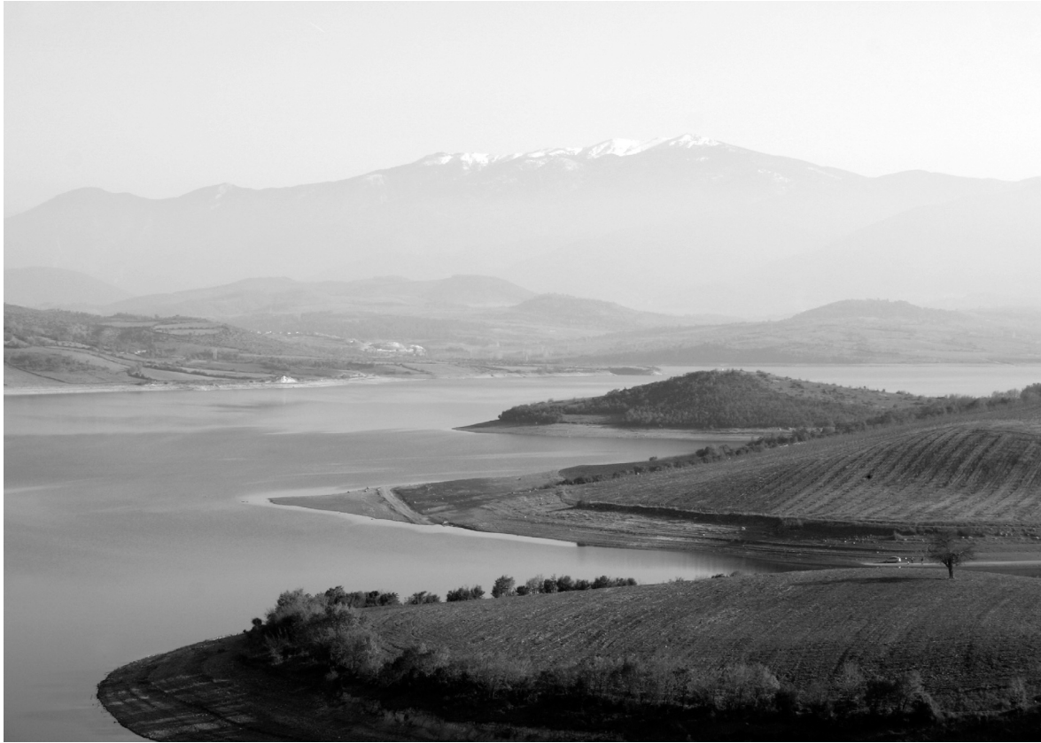
Fig. 3: The Bayramiç valley with the densely forested Kaz Dağı (Höhfeld 2009, 22).

on the outside and the Simois and Granicus on the inside as the subsequent inward half circle of rivers, both of which actually flowed directly into the sea at the time. The next half circle is formed by the Rhodius and the Caresus as Biga Çayı (Çan Çayı in its headwaters), still separated at the time from the Granicus, the Kocadere today, which nowadays unites with the Biga Çayı downriver from Biga after the river was regulated over 100 years ago.